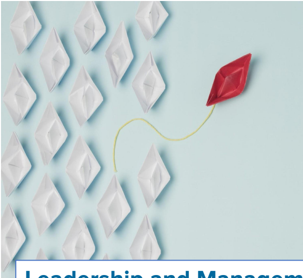
Leadership and Management